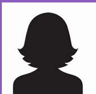
This could be you XYZ Scholarship Recipient 2020