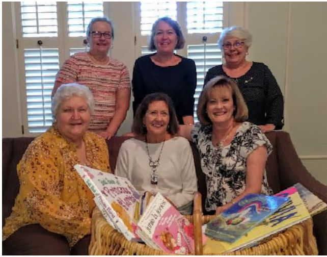
Beta donates books to High Tower Elem School