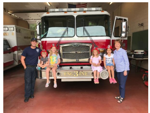
Omicron member included grandchildren in thanking firemen during Alpha Delta Kappa