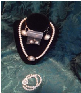
Disaster Relief Pearl Necklace set

Information about State Convention, Cornucopia Updates, and other important information!