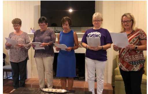
Alpha Iota and Fidelis Alpha