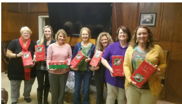
Beta Lambda completes 18 Christmas Boxes for Operation Christmas Child