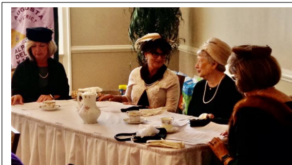
Augusta District Meeting

Founders' Day Skit: Discovering the Pearls of Sisterhood: Then and Now