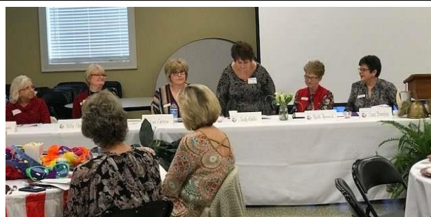
Albany District Leaders