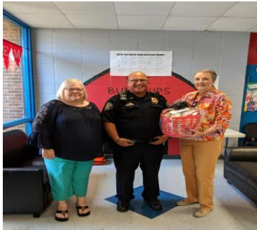
Phi sisters participate in Alzheimer's Walk