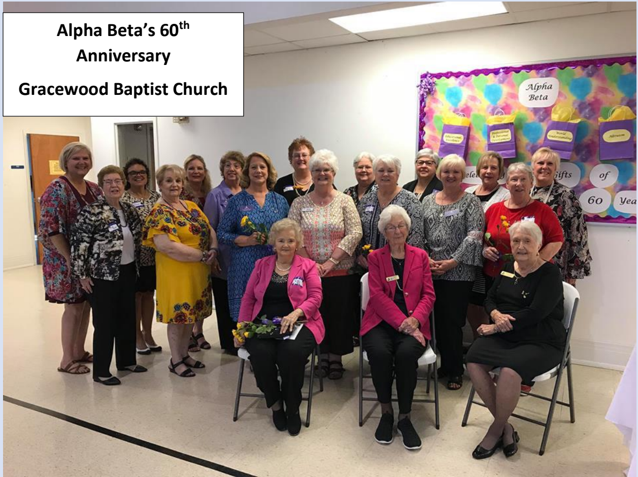
ALPHA BETA and GUESTS