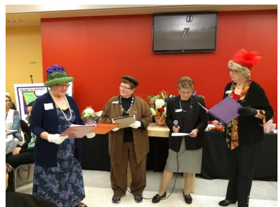
Tri-District Celebrates Founders' Day!