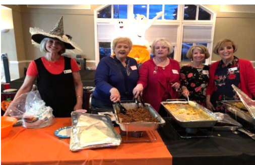
Theta helps with Adult Special Needs Halloween Dance