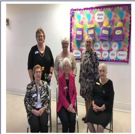
Six State Presidents