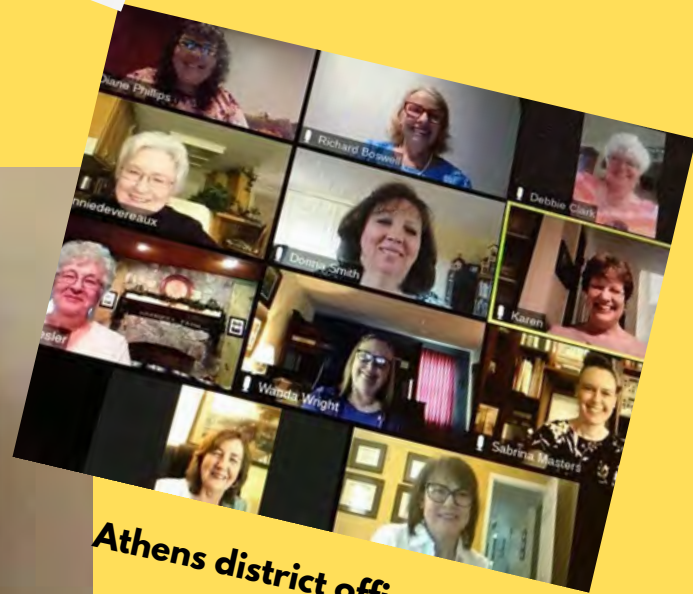
Athens district officers 2020-22

New Website Look and Feel! http://www.gaalphadeltakappa.org