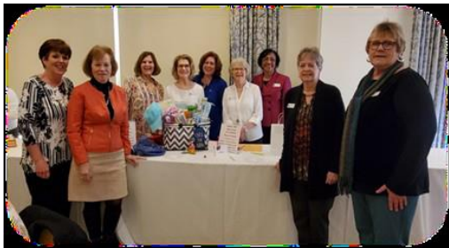
Alpha Atlanta District