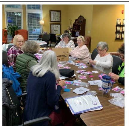
Alpha Nu Decorating at Riverwood Senior Living