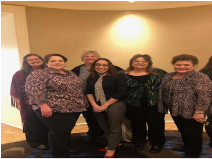
ATLANTA DISTRICT-ALPHA TAU