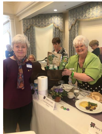
I won Alpha Phi's St. Patrick's Day Basket