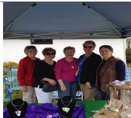
GA Sigma sisters enjoyed selling their unique broken-china jewelry to raise money for 3 Scholarships to be awarded this year to future teachers in the education program at Augusta University.