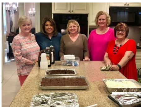
Alpha Epsilon providing meal at Fisher House