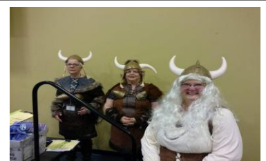
The Vikings Are Here!!!