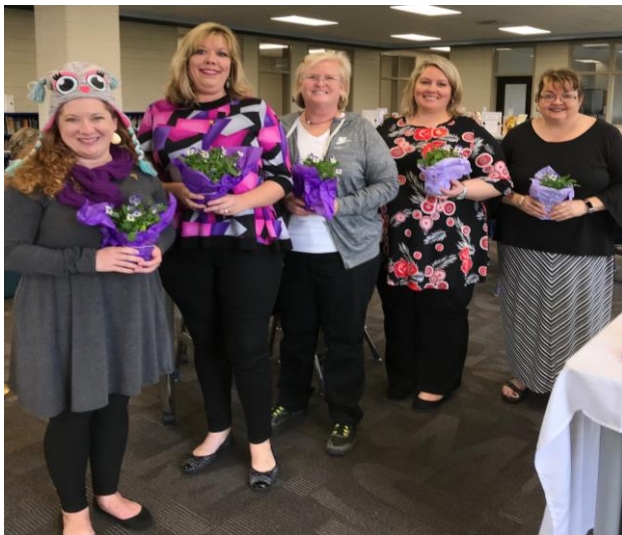
Beta Phi's New Sisters