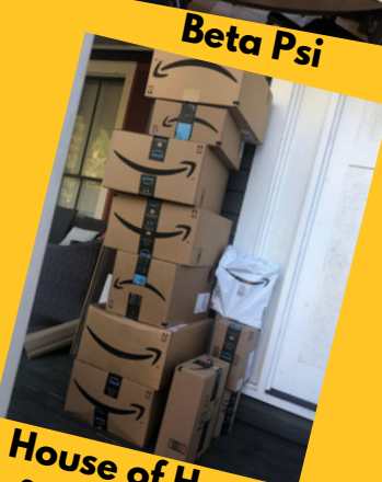
House of Hope Some of GA AAK donations