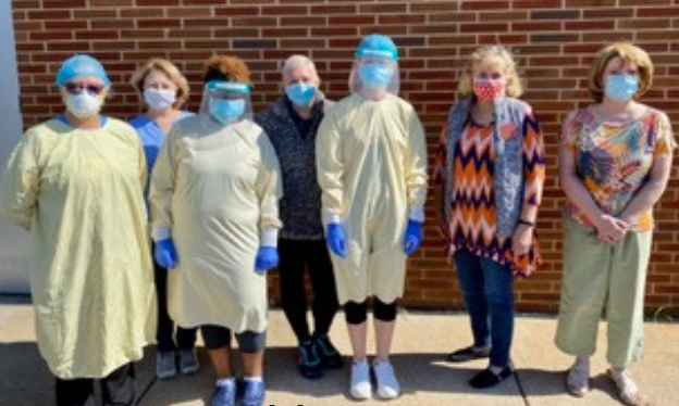
Alpha Zeta serving dinner to COVID Testers