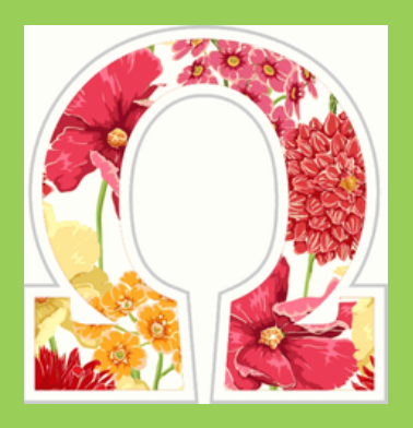
Omega Rebecca Reese Sigma