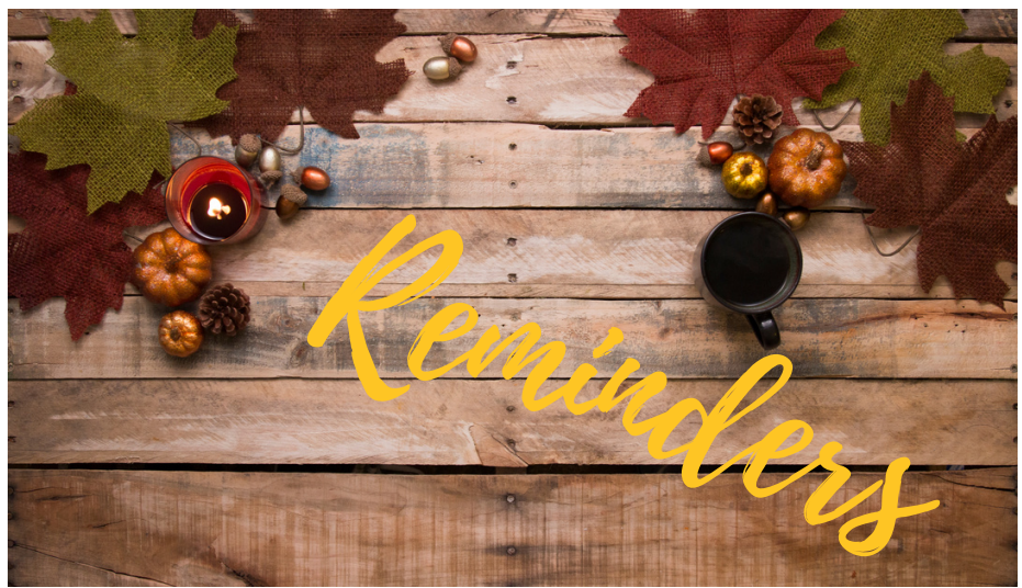
Text and photo by Norma Rushing

Sisters who have had COVID 19 Surgery Falls Family deaths Active Classroom Teachers