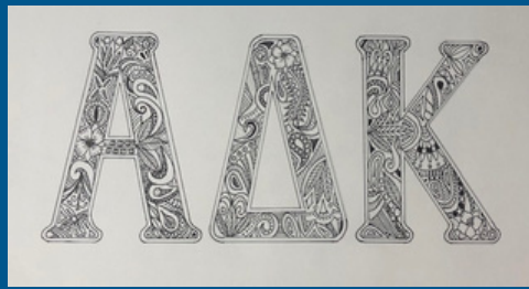
Paisley Note Cards