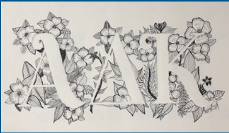
Violet Note Cards

Pen & inks by Suzi Bonifay. To order contact Suzi Bonifay by text 229- 416-6195 or email sbonifay72@att.net and specify which card/s. $17 for 10 cards/envelopes. Size 5.5" X 4.25" black ink on white stock. Payment can be made by check, PayPal or Venmo.