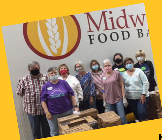
Gamma Epsilon Helping at Food Bank Collecting Books for "Books Across Georgia"