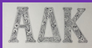
Paisley Note Cards