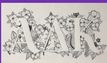
Violet Note Cards

Pen & inks by Suzi Bonifay. To order contact Suzi Bonifay by text 229- 416-6195 or email sbonifay72@att.net and specify which card/s. $17 for 10 cards/envelopes. Size 5.5" X 4.25" black ink on white stock. Payment can be made by check, PayPal or Venmo.