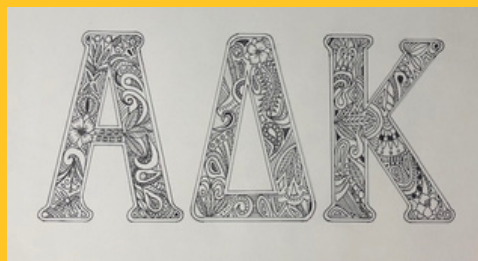
Paisley Note Cards