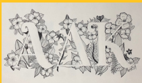
Violet Note Cards

Pen & inks by Suzi Bonifay. To order contact Suzi Bonifay by text 229- 416-6195 or email sbonifay72@att.net and specify which card/s. $17 for 10 cards/envelopes. Size 5.5" X 4.25" black ink on white stock. Payment can be made by check, PayPal or Venmo.