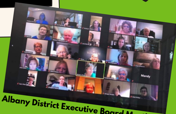
Albany District Executive Board Meeting