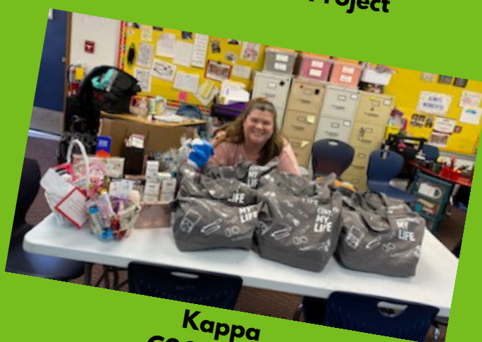
Kappa C20 Project Personal items to Nursing Home