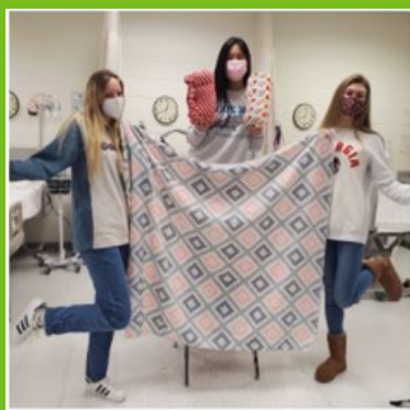
Gamma Epsilon's Blanket C20 Project