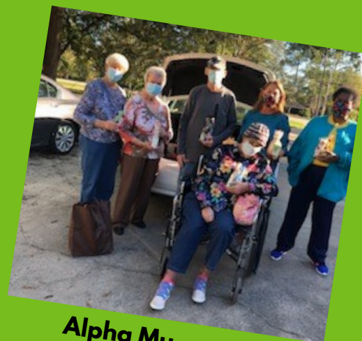
Alpha Mu C20 Project