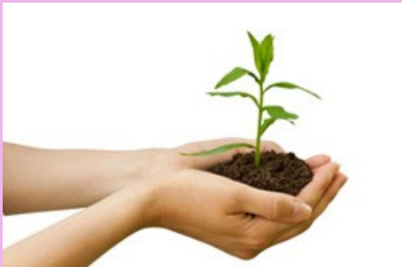
Alpha Nu Cultivating Possibilities