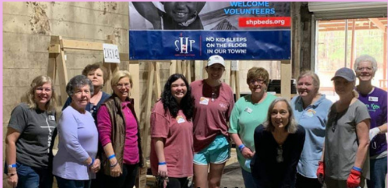
Beta Iota building beds