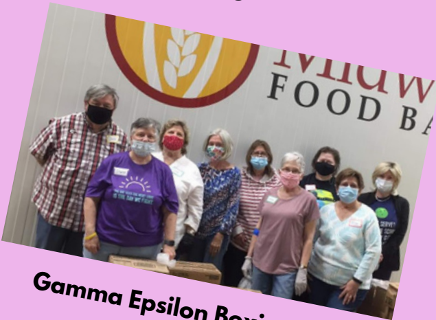
Gamma Epsilon Boxing Food