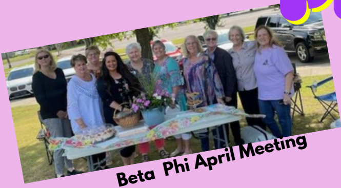
Beta Phi April Meeting