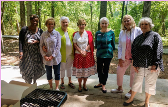
Theta's May Meeting