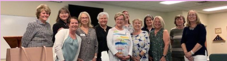
Beta Delta's May Meeting