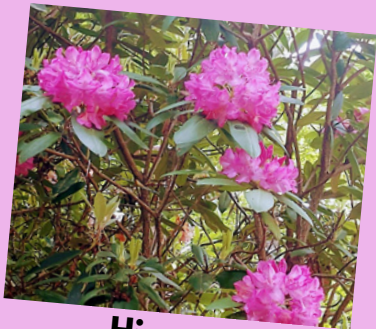
Hiwassee Hamilton Gardens