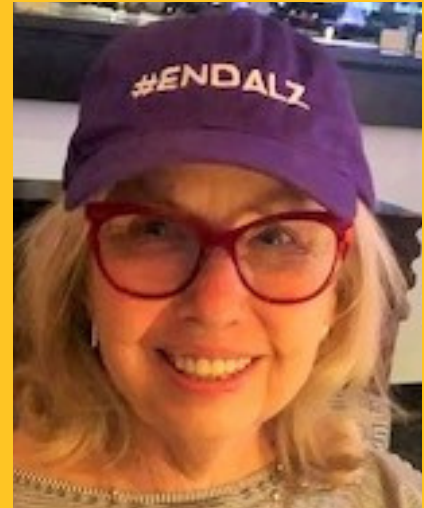
GAMMA EPSILON focused on BEAD making for bracelets.