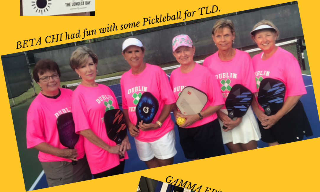
BETA CHI had fun with some Pickleball for TLD.