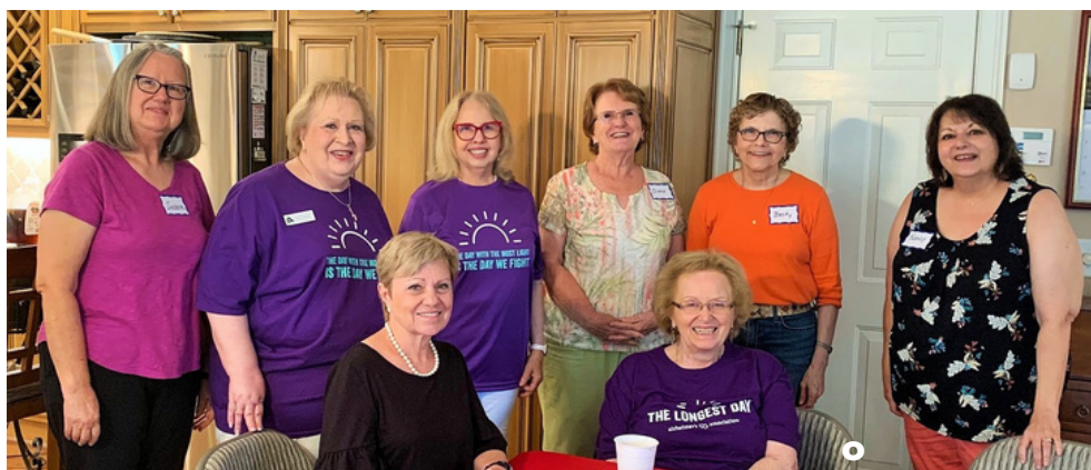
Beta Gamma Games and Breakfast, Lunch, and Dinner made for friends and community members.