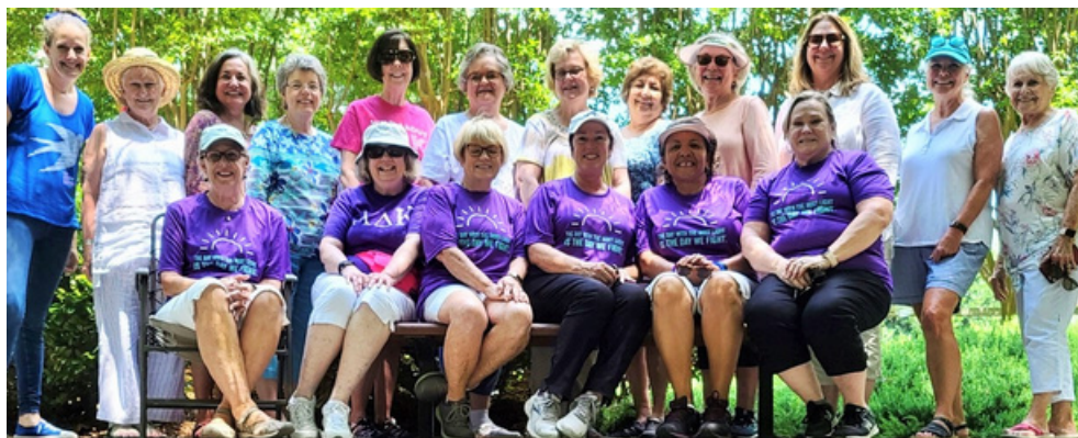
Delta Sisters Picnic and Walk in the Park

Update on our GA AΔK Team's latest Raised Funds as of 6-28-21 $14,056! GO SISTERS! Our 2021 Goal is $20,000. I know we can do it! WE are GEORGIA AΔK Strong!