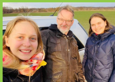
Daughters from Ukraine and driver to Poland Border

May you have all the happiness and luck that life can hold and at the end of your rainbow may you find a Pot of gold.