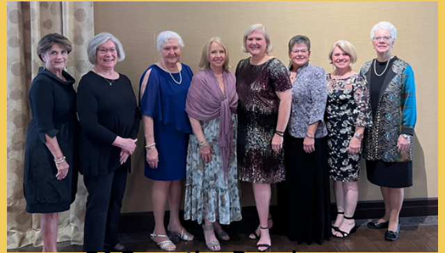
GA Executive Board at the 75th International Convention!

More pictures will be shared in the September newsletter. Please email me any that you would like to have shared!