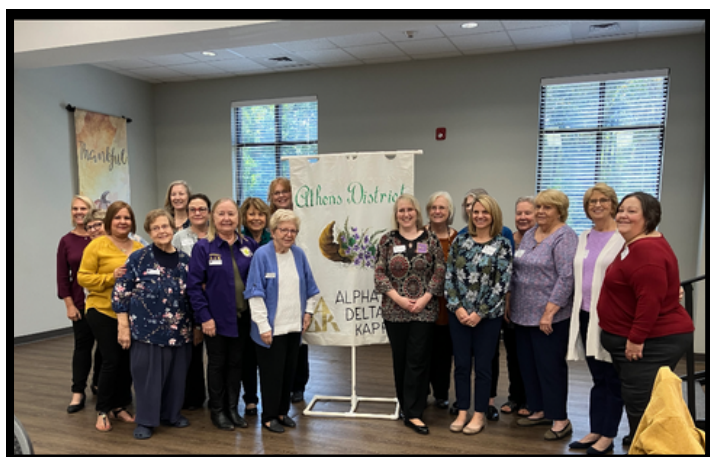
Host Chapter Beta Eta