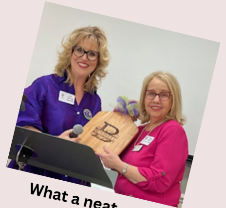
What a neat surprise!