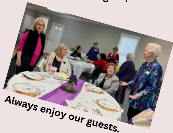
Always enjoy our guests.